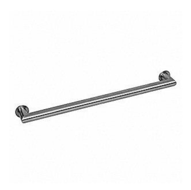
Web Price $111.00 / each